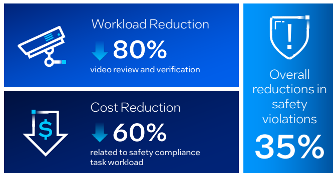
Figure 2. The bottling company reduced manual workloads by 80 percent and reduced the costs related to HSE compliance by 60 percent. Overall safety violations were reduced by 35 percent. 3

Almost overnight, the bottling company witnessed enormous benefits that totally altered how it approached monitoring and inspection. It had an advanced solution in place that accommodated today's complex and highly automated requirements.